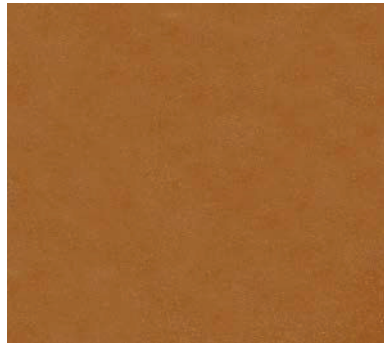
CS-16 Faded Terracotta