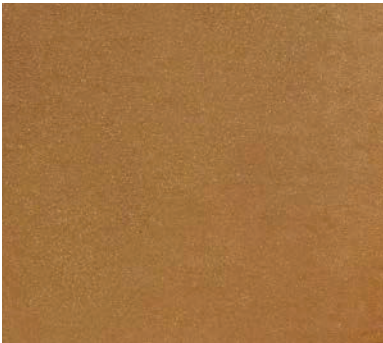
CS-2 Padre Brown