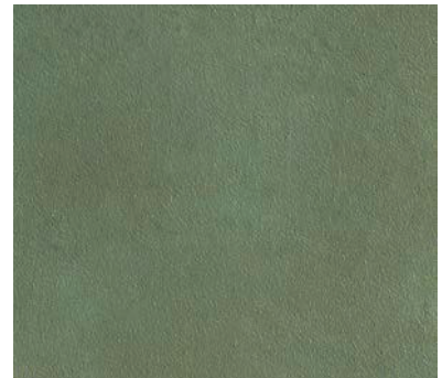
CS-13 Copper Patina*