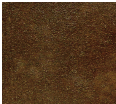
CS-14 Dark Walnut