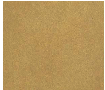
CS-15 Antique Amber