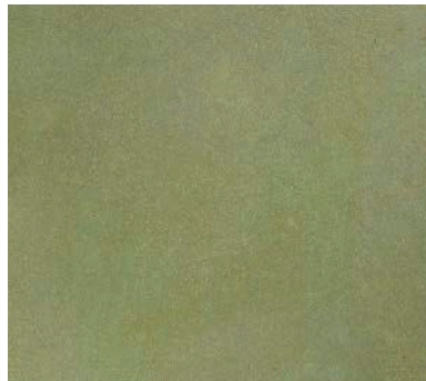
CS-11 Fern Green*